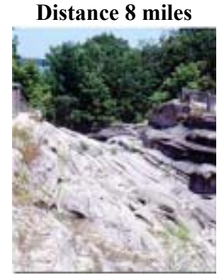
Glacier groves on Kelley's Island

This leg of your swim will take you past some of the most treacherous shoals and channels on the Great Lakes. Many boats have lost their way in these waters and have paid the ultimate price for it. You will swim over no less than four wrecks in your eightmile journey to Kelley's Island. As you swim past Middle Island (the southernmost point of Canada) and pass Gull Island shoal, see if you can get a glimpse of the wrecks of the King Sisters, William Crosthuate, Adventure or the FH Prince, all of which lost their way in these waters and sank to the bottom. Once on Kelley's Island, it's time to find one of the many famous local pubs for some fine food and wine for which the area is famous.