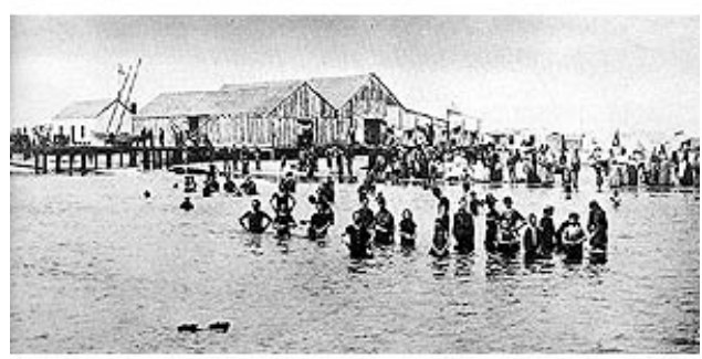
Grand Army of the Republic Encampment taken in the year of 1888 at Anaheim Landing. Warehouses in the background were built in 1868