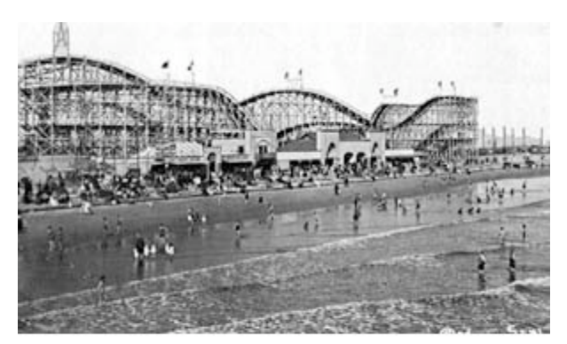
The famous Seal Beach roller coaster, 1915.

The roller coaster, which was part of the standard equipment for Pleasure Piers in the early years of the 20<sup>th</sup> Century, and which is shown here, is now gone. The only remaining old-style roller coasters along the California coastline are at Mission Beach, at Belmont Park in San Diego, the famous roller coaster in Santa Cruz, and the newer style Pacific Park at Santa Monica Pier—but you aren't there yet.